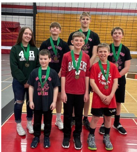
Left: Maplewood Badgers/ Neillsville Lights/Lucky Clovers B Team 1st place