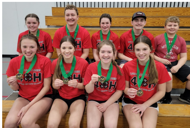
Loyal Lads & Lassies, A Team 1st place