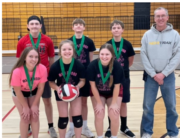
Maplewood Badgers-Team 2, A Team 2nd place