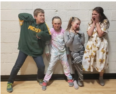
Above: Cast members of "Ma and the Kids" Rock Creek Rangers