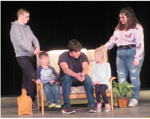
Above: Members of Lucky Clovers performing "Is That Your Final Answer?"