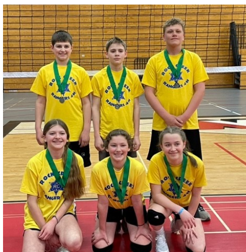
Right: Rock Creek Rangers B Team 2nd place