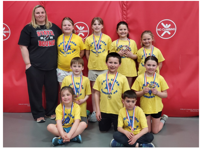
Rock Creek Rangers— 2nd Place "C" Team