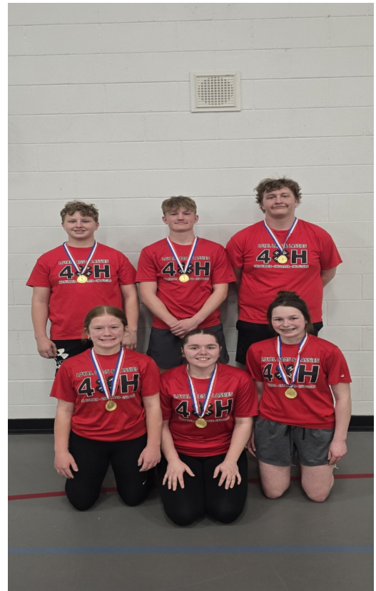
Loyal Lads & Lassies- "A League Champs"