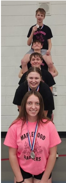
Maplewood Badgers— 2nd place