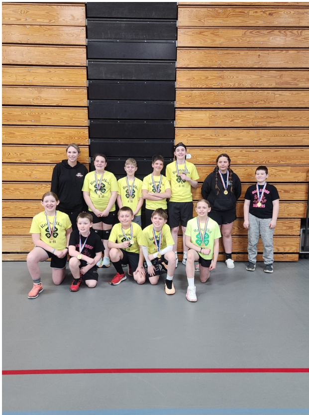
Romadka 4-H Club